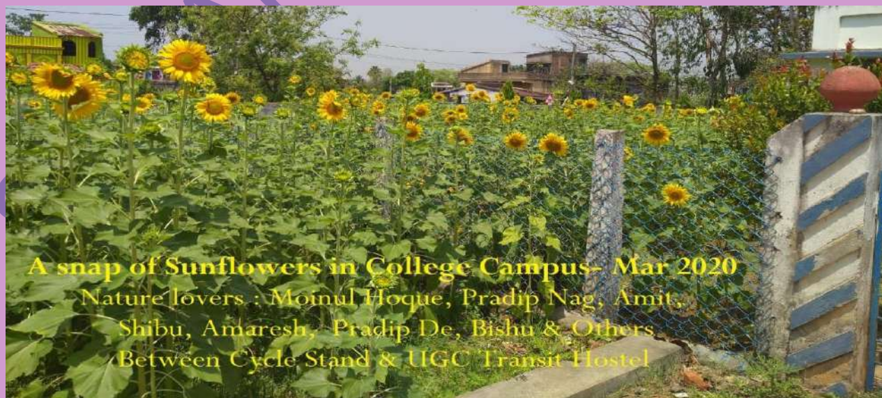
A snap of Sunflowers in College Campus- Mar 2020

Notification shall be available in college website as and when instructed by BKU/DPI.